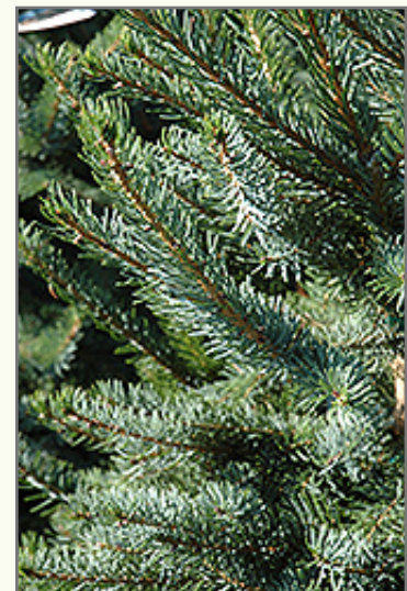
Brun's Serbian Spruce foliage