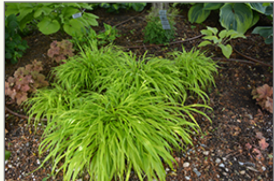
All Gold Japanese Forest Grass