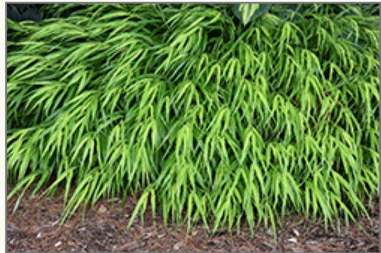
All Gold Japanese Forest Grass foliage

All Gold Japanese Forest Grass is recommended for the following landscape applications;