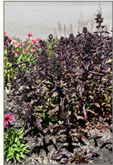
Dakota Burgundy Beard Tongue

Dakota Burgundy Beard Tongue is a fine choice for the garden, but it is also a good selection for planting in outdoor pots and containers. With its upright habit of growth, it is best suited for use as a 'thriller' in the 'spiller-thriller-filler' container combination; plant it near the center of the pot, surrounded by smaller plants and those that spill over the edges. Note that when growing plants in outdoor containers and baskets, they may require more frequent waterings than they would in the yard or garden. Be aware that in our climate, most plants cannot be expected to survive the winter if left in containers outdoors, and this plant is no exception. Contact our experts for more information on how to protect it over the winter months.