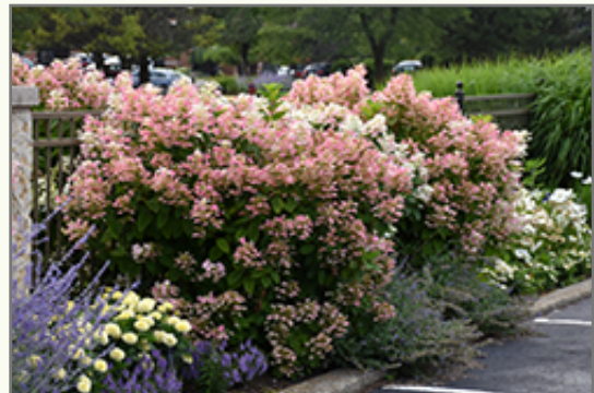
Quick Fire® Hydrangea in bloom