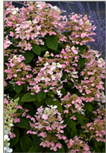
Quick Fire® Hydrangea flowers

Quick Fire® Hydrangea is recommended for the following landscape applications;