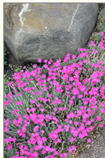
Firewitch Dianthus in bloom