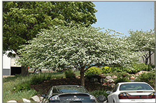
Thornless Cockspur Hawthorn in bloom