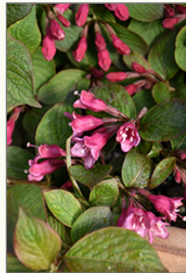
Midnight Sun Reblooming Weigela flowers