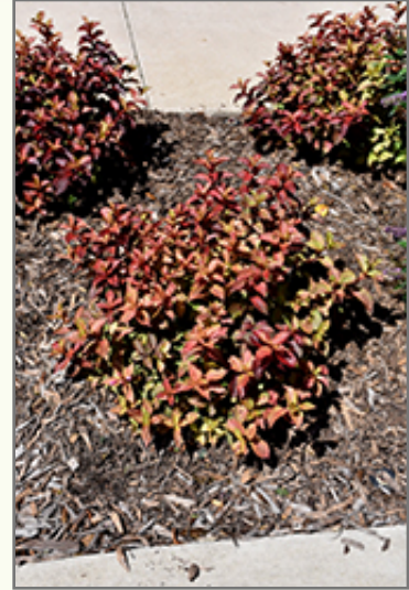
Midnight Sun Reblooming Weigela