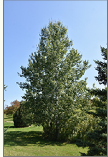
Quaking Aspen