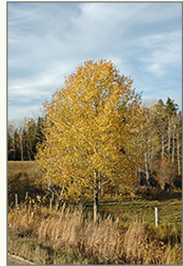
Quaking Aspen in fall