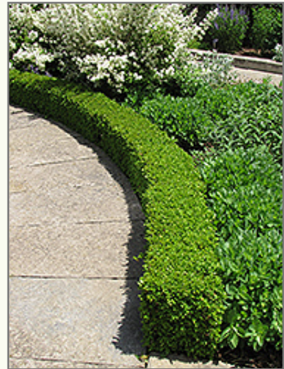
Green Velvet® Boxwood