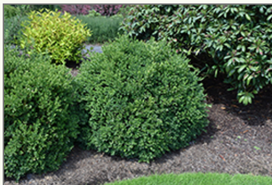
Green Velvet® Boxwood

Green Velvet® Boxwood is recommended for the following landscape applications;