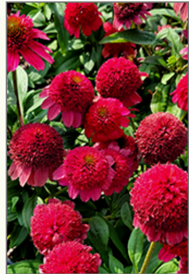
Sunny Days Ruby Coneflower flowers

Sunny Days Ruby Coneflower is an herbaceous perennial with an upright spreading habit of growth. Its medium texture blends into the garden, but can always be balanced by a couple of finer or coarser plants for an effective composition.