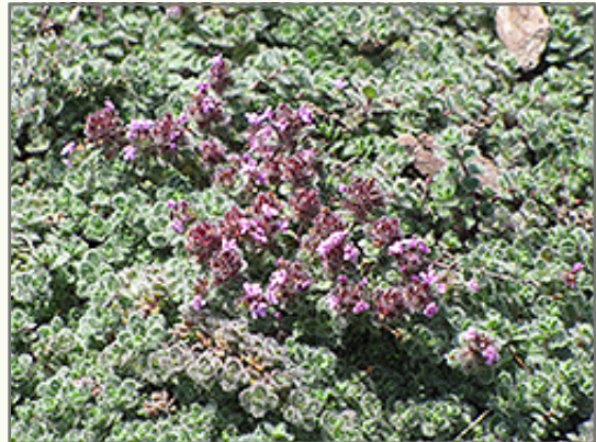
Wooly Creeping Thyme flowers