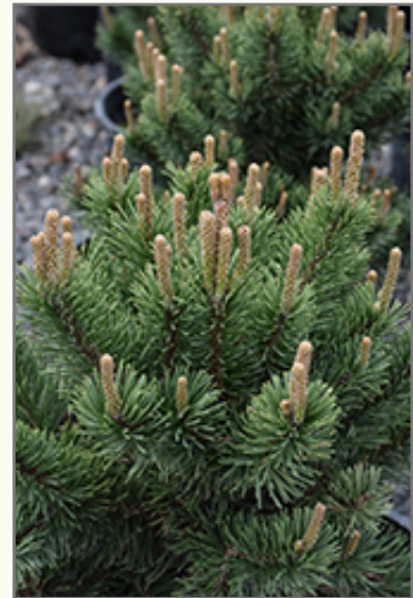
Lakeview Dwarf Mugo Pine foliage