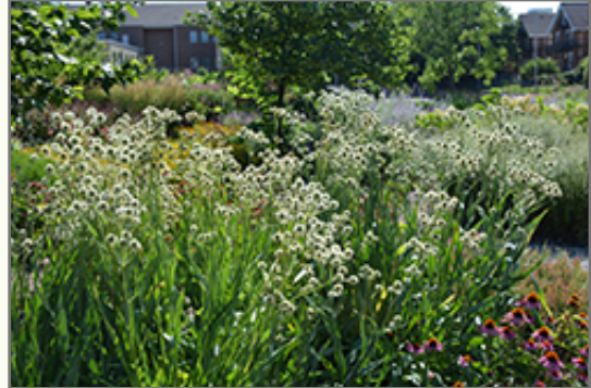
Rattlesnake Master in bloom