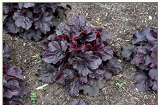
Northern Exposure Black Coral Bells