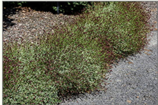
Little Angel Burnet in bloom

Little Angel Burnet is an open herbaceous perennial with a rigidly upright and towering form. It brings an extremely fine and delicate texture to the garden composition and should be used to full effect.