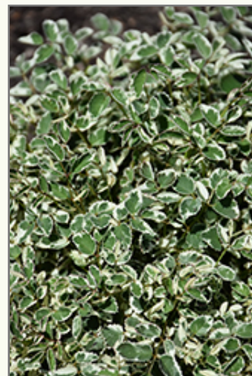
Little Angel Burnet flowers

This plant does best in full sun to partial shade. It prefers to grow in average to moist conditions, and shouldn't be allowed to dry out. It is not particular as to soil type or pH. It is somewhat tolerant of urban pollution. This is a selected variety of a species not originally from North America. It can be propagated by division; however, as a cultivated variety, be aware that it may be subject to certain restrictions or prohibitions on propagation.