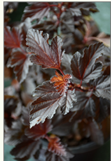
First Editions® Fireside® Ninebark flowers