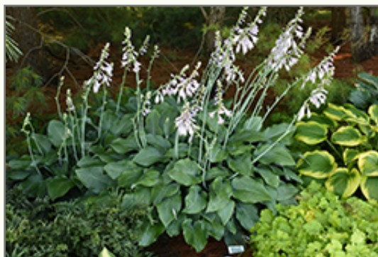
Krossa Regal Hosta in bloom

Krossa Regal Hosta will grow to be about 3 feet tall at maturity extending to 4 feet tall with the flowers, with a spread of 4 feet. When grown in masses or used as a bedding plant, individual plants should be spaced approximately 4 feet apart. Its foliage tends to remain dense right to the ground, not requiring facer plants in front. It grows at a medium rate, and under ideal conditions can be expected to live for approximately 10 years. As an herbaceous perennial, this plant will usually die back to the crown each winter, and will regrow from the base each spring. Be careful not to disturb the crown in late winter when it may not be readily seen!