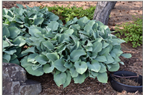
Krossa Regal Hosta