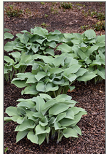
Krossa Regal Hosta