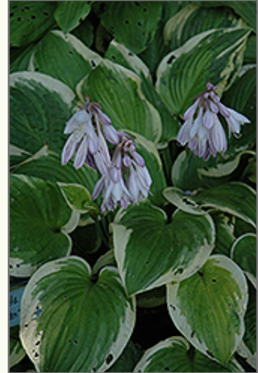
Golden Tiara Hosta flowers