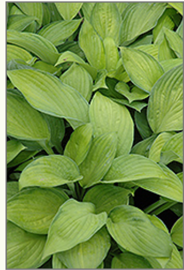
Gold Standard Hosta foliage

Gold Standard Hosta is recommended for the following landscape applications;