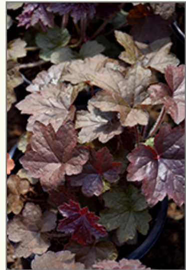
Palace Purple Coral Bells foliage

Palace Purple Coral Bells is recommended for the following landscape applications;