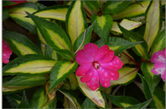
SunPatiens Compact Tropical Rose New Guinea Impatiens flowers

SunPatiens Compact Tropical Rose New Guinea Impatiens is a fine choice for the garden, but it is also a good selection for planting in outdoor containers and hanging baskets. It can be used either as 'filler' or as a 'thriller' in the 'spiller-thriller-filler' container combination, depending on the height and form of the other plants used in the container planting. It is even sizeable enough that it can be grown alone in a suitable container. Note that when growing plants in outdoor containers and baskets, they may require more frequent waterings than they would in the yard or garden.