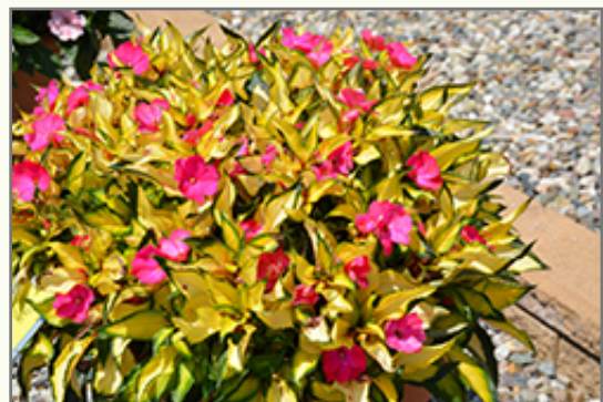
SunPatiens Compact Tropical Rose New Guinea Impatiens in bloom