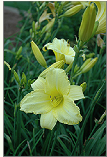
Happy Returns Daylily flowers

Happy Returns Daylily is recommended for the following landscape applications;