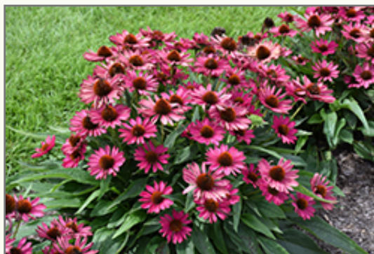
Kismet® Raspberry Coneflower in bloom