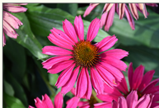
Kismet® Raspberry Coneflower flowers