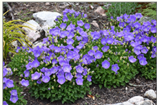
Rapido Blue Campanula in bloom