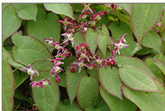
Red Epimedium flowers

Red Epimedium is a dense herbaceous evergreen perennial with a ground-hugging habit of growth. Its relatively fine texture sets it apart from other garden plants with less refined foliage.