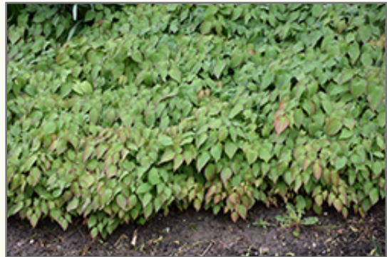
Red Epimedium