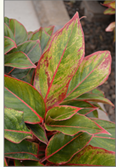
Siam Aurora Chinese Evergreen foliage

This is an herbaceous houseplant with an upright spreading habit of growth. This plant may benefit from an occasional pruning to look its best.