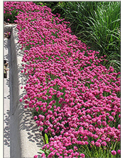
Dusseldorf Pride Armeria in bloom

Dusseldorf Pride Armeria is recommended for the following landscape applications;