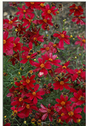
Red Satin Coreopsis in bloom