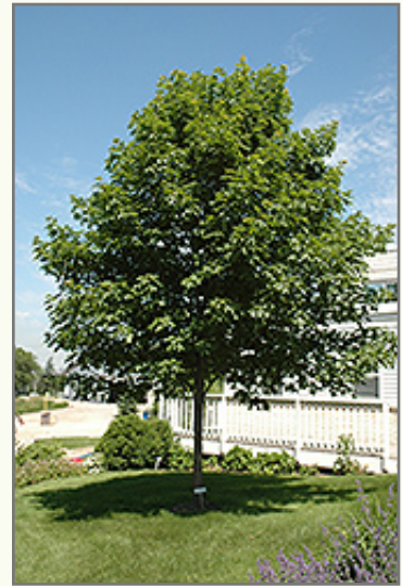
Fall Fiesta® Sugar Maple