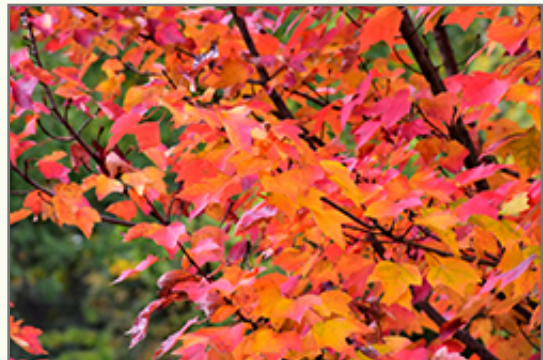
Red Rocket Red Maple in fall