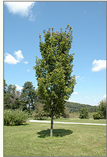
Red Rocket Red Maple