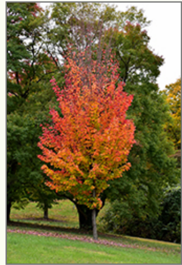
Red Rocket Red Maple in fall

Red Rocket Red Maple is a dense deciduous tree with a narrowly upright and columnar growth habit. Its average texture blends into the landscape, but can be balanced by one or two finer or coarser trees or shrubs for an effective composition.