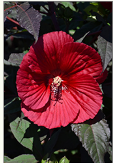
Midnight Marvel Hibiscus flowers

This plant will require occasional maintenance and upkeep, and should be cut back in late fall in preparation for winter. It is a good choice for attracting butterflies and hummingbirds to your yard. Gardeners should be aware of the following characteristic(s) that may warrant special consideration;