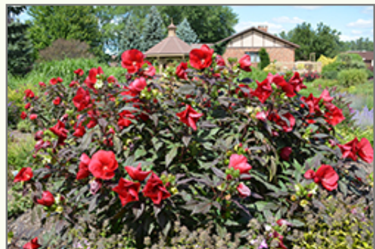
Midnight Marvel Hibiscus in bloom