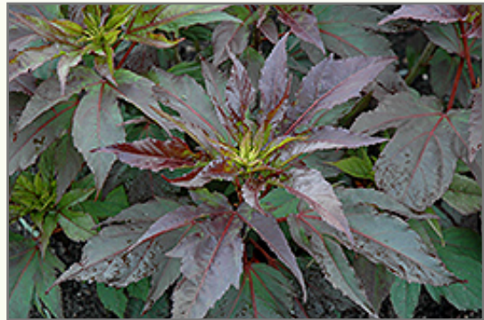
Midnight Marvel Hibiscus foliage