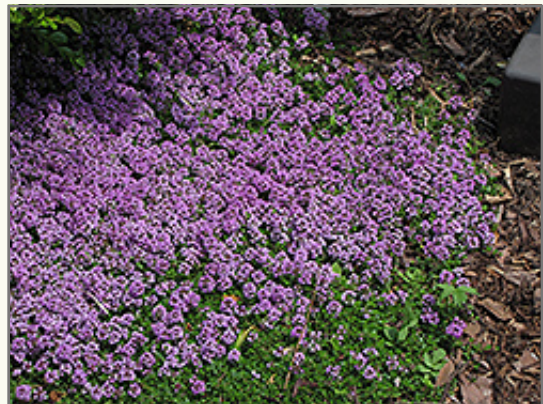
Purple Carpet Creeping Thyme in bloom