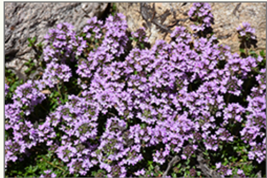
Purple Carpet Creeping Thyme flowers

Purple Carpet Creeping Thyme is a dense herbaceous evergreen perennial with a ground-hugging habit of growth. It brings an extremely fine and delicate texture to the garden composition and should be used to full effect.