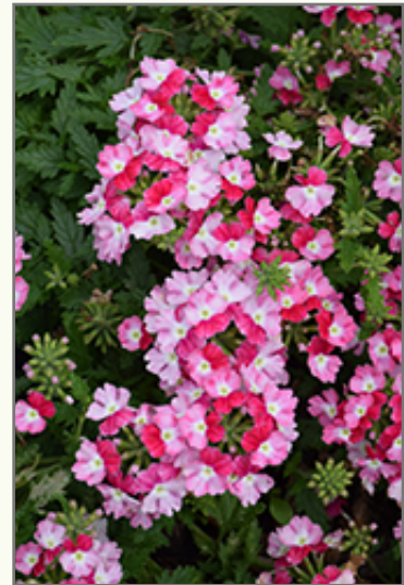
Lanai Twister Red Verbena flowers

This plant will require occasional maintenance and upkeep. Trim off the flower heads after they fade and die to encourage more blooms late into the season. Deer don't particularly care for this plant and will usually leave it alone in favor of tastier treats. It has no significant negative characteristics.