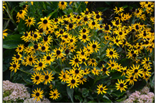
Little Goldstar Black Eyed Susan in bloom

Little Goldstar Black Eyed Susan is an herbaceous perennial with an upright spreading habit of growth. Its medium texture blends into the garden, but can always be balanced by a couple of finer or coarser plants for an effective composition.