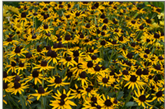
Little Goldstar Black Eyed Susan flowers