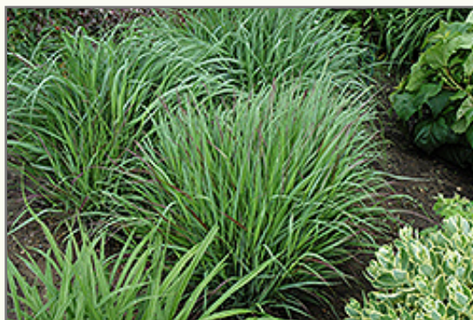
Prairie Winds® Cheyenne Sky Switchgrass