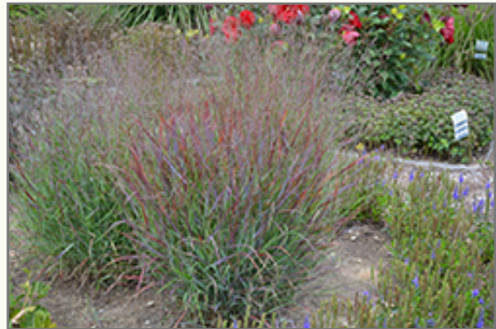
Prairie Winds® Cheyenne Sky Switchgrass

This is a relatively low maintenance plant, and is best cut back to the ground in late winter before active growth resumes. It has no significant negative characteristics.