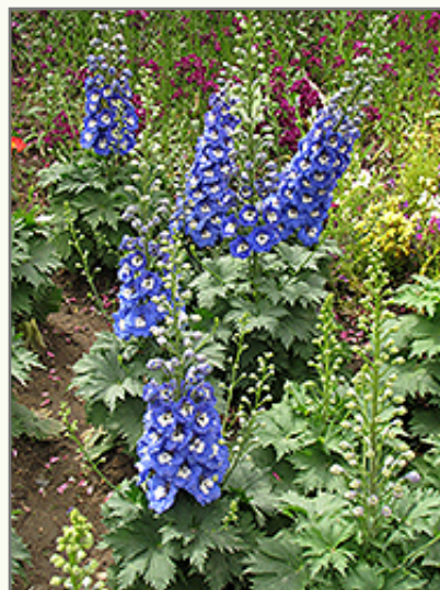
Magic Fountains Blue White Bee Larkspur in bloom

Magic Fountains Blue White Bee Larkspur is recommended for the following landscape applications;