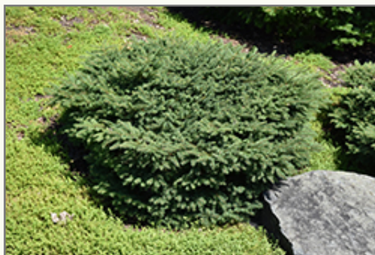
Bird's Nest Spruce

Bird's Nest Spruce is recommended for the following landscape applications;