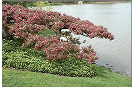
Candied Apple Flowering Crab in bloom

Candied Apple Flowering Crab is recommended for the following landscape applications;