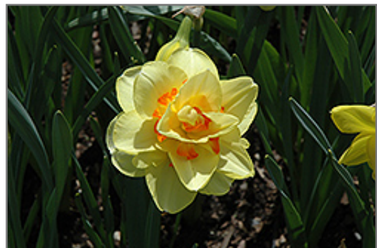
Tahiti Daffodil flowers