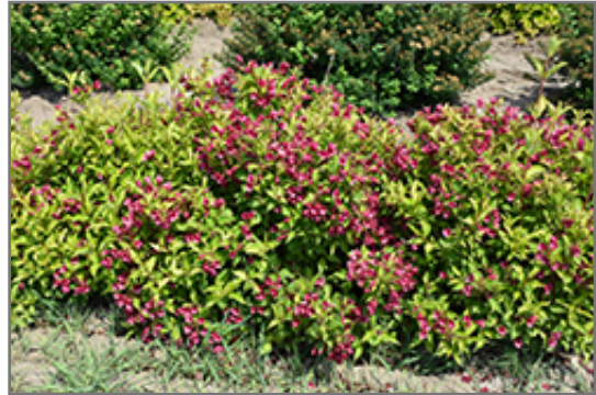
Ghost Weigela in bloom

* This is a 'special order' plant - contact store for details