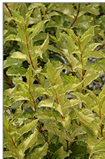
Ghost Weigela foliage