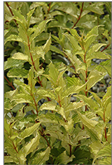
Ghost Weigela foliage