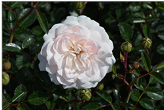
Sea Foam Rose flowers

This shrub will require occasional maintenance and upkeep, and is best pruned in late winter once the threat of extreme cold has passed. It is a good choice for attracting bees to your yard. Gardeners should be aware of the following characteristic(s) that may warrant special consideration;