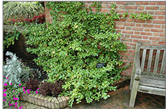
Sarcoxie Wintercreeper

Sarcoxie Wintercreeper is recommended for the following landscape applications;