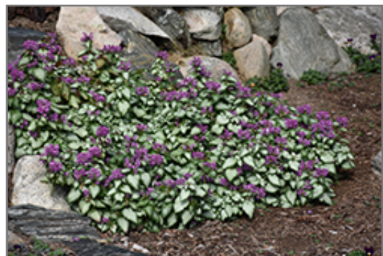
Purple Dragon Spotted Dead Nettle in bloom