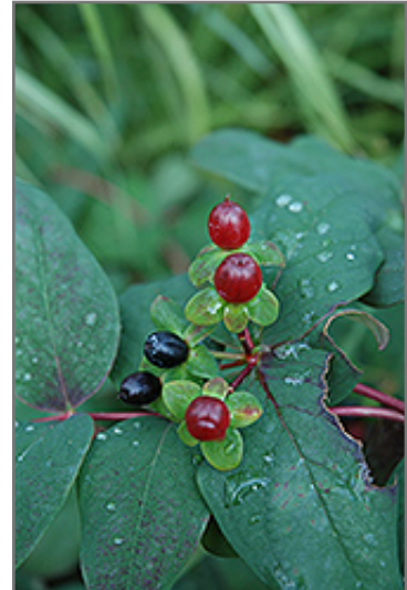
Albury Purple St. John's Wort fruit

Albury Purple St. John's Wort makes a fine choice for the outdoor landscape, but it is also well-suited for use in outdoor pots and containers. With its upright habit of growth, it is best suited for use as a 'thriller' in the 'spiller-thriller-filler' container combination; plant it near the center of the pot, surrounded by smaller plants and those that spill over the edges. It is even sizeable enough that it can be grown alone in a suitable container. Note that when grown in a container, it may not perform exactly as indicated on the tag - this is to be expected. Also note that when growing plants in outdoor containers and baskets, they may require more frequent waterings than they would in the yard or garden.