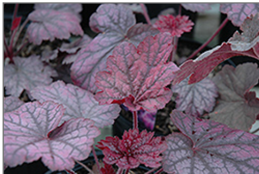
Midnight Bayou Coral Bells foliage

Midnight Bayou Coral Bells is recommended for the following landscape applications;