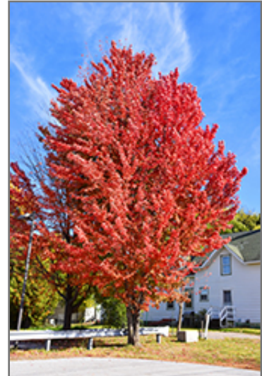
Celebration Maple in fall