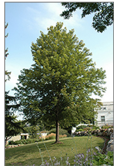
Celebration Maple