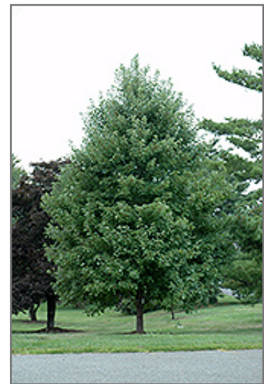
October Glory Red Maple