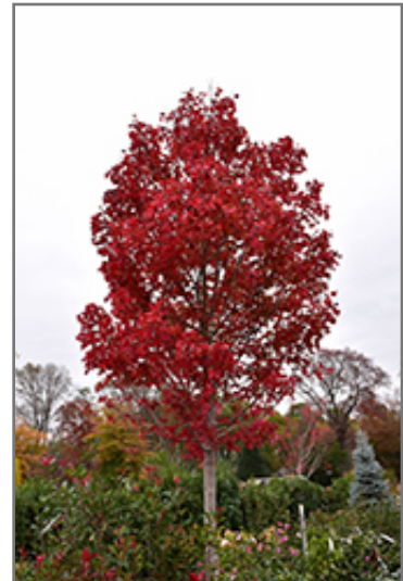
October Glory Red Maple in fall