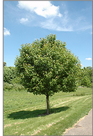
Northwood Red Maple

* This is a 'special order' plant - contact store for details