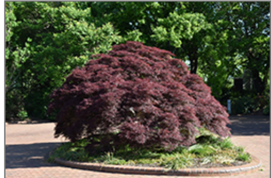
Purple-Leaf Threadleaf Japanese Maple

Purple-Leaf Threadleaf Japanese Maple is recommended for the following landscape applications;