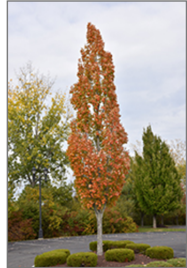
Armstrong Maple in fall

This tree should only be grown in full sunlight. It is quite adaptable, preferring to grow in average to wet conditions, and will even tolerate some standing water. It is not particular as to soil type or pH. It is highly tolerant of urban pollution and will even thrive in inner city environments. This particular variety is an interspecific hybrid.