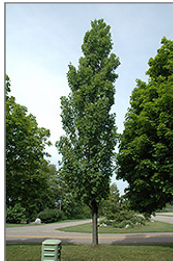
Armstrong Maple